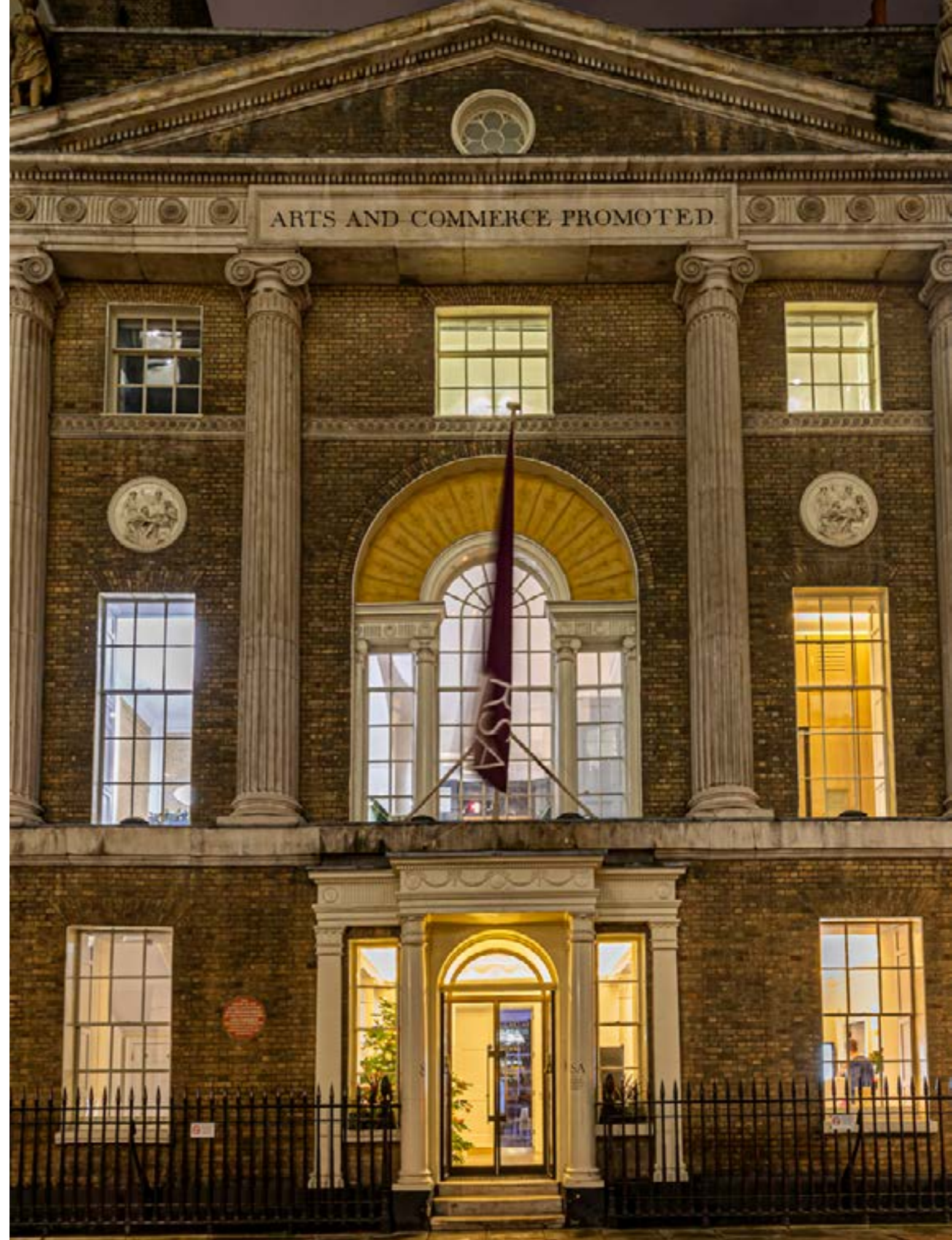
The first International Cooperative Congress was held at the Royal Society of Arts, 19-22 August 1895

I think the common ground was there from the beginning. There was a common understanding that a cooperative was democratic, it was egalitarian, it limited the role of capital and emphasised the role of the member. And it was about self-help to relieve a problem – that was its objective. That understanding was found throughout cooperative ideas geographically.